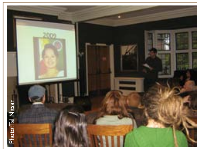
Green College residents organized an International Women's Day event on March 8, 2009, featuring guest speakers.

A one-day symposium on the measurement and determinants of overall well-being and implications for a sustainable society. Co-sponsored by the Canadian Institute for Advanced Research.