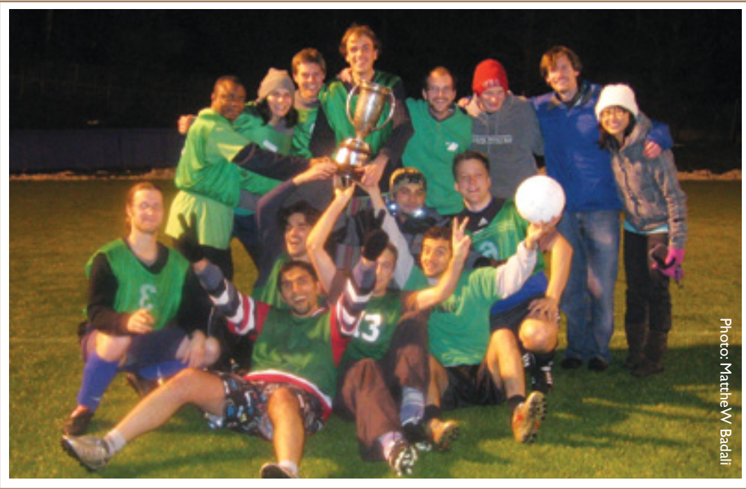
Green College's intramural soccer team ("The Green Machine") wins the Men's Tier Two divisional championship on November 28, 2010.