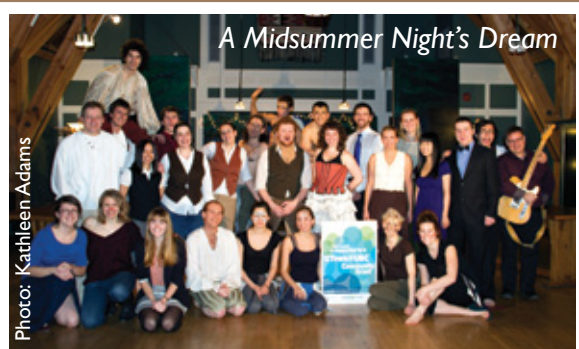
A Midsummer Night's Dream