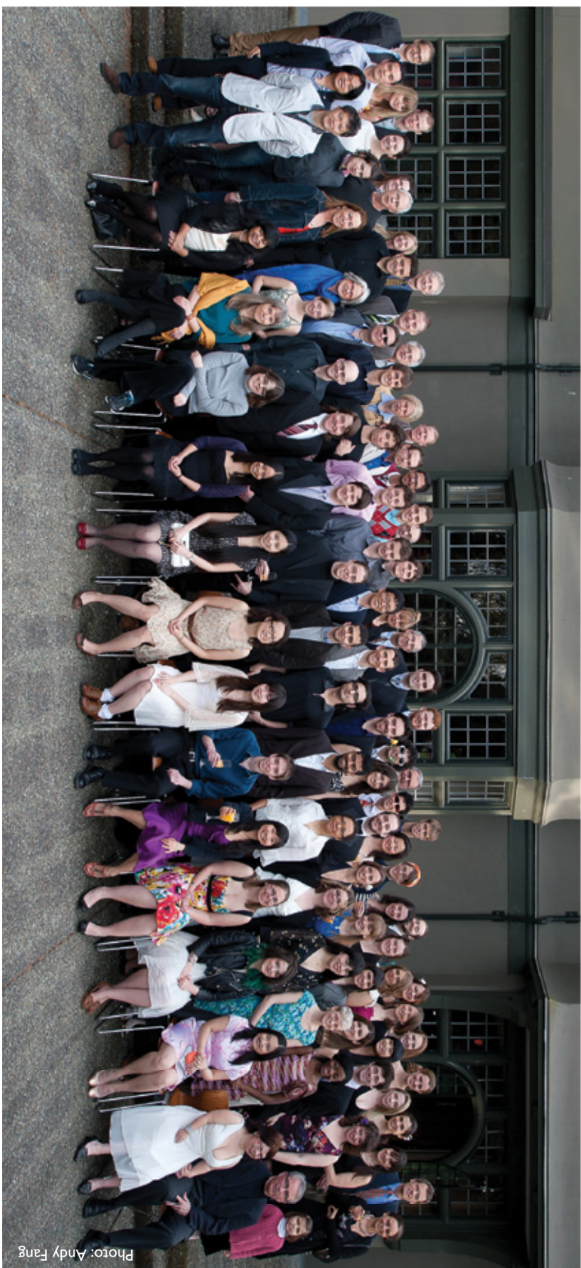
GREEN COLLEGE SPRING GALA - APRIL 2012