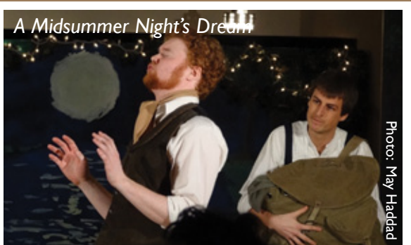
A Midsummer Night's Dream