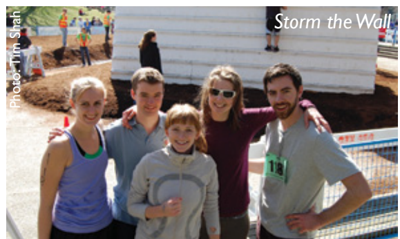
Storm the Wall