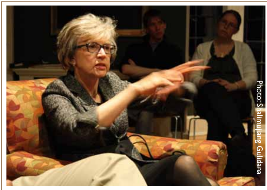
The Right Hon. Beverley McLachlin, Chief Justice of Canada