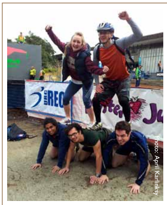
Green College stood tall in Storm the Wall